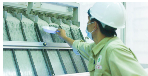
Worker looks over the rice

However, average prices in the first five months decreased by 0.9% to USD445.5 per tonne compared to last year. Read more